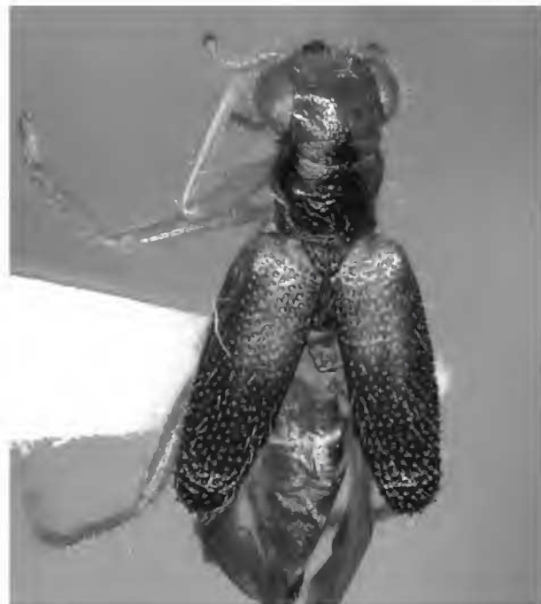
Fig. 4. Phyllobaenus verticalis Say, dorsal habitus. Length 4 mm. Specimen is from Great Falls Park, Fairfax County, Virginia.